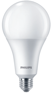
E27 A 30mm Frosted