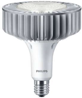
True Force E40 T50