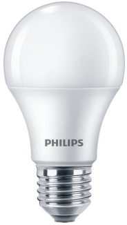
E27 A 60mm Frosted